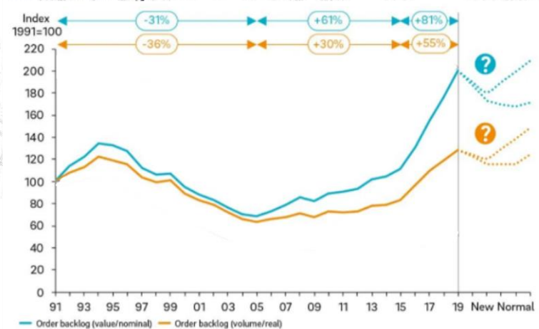
NOTE: All numbers calculated based on data on companies of German key construction industry with 20 or more employees